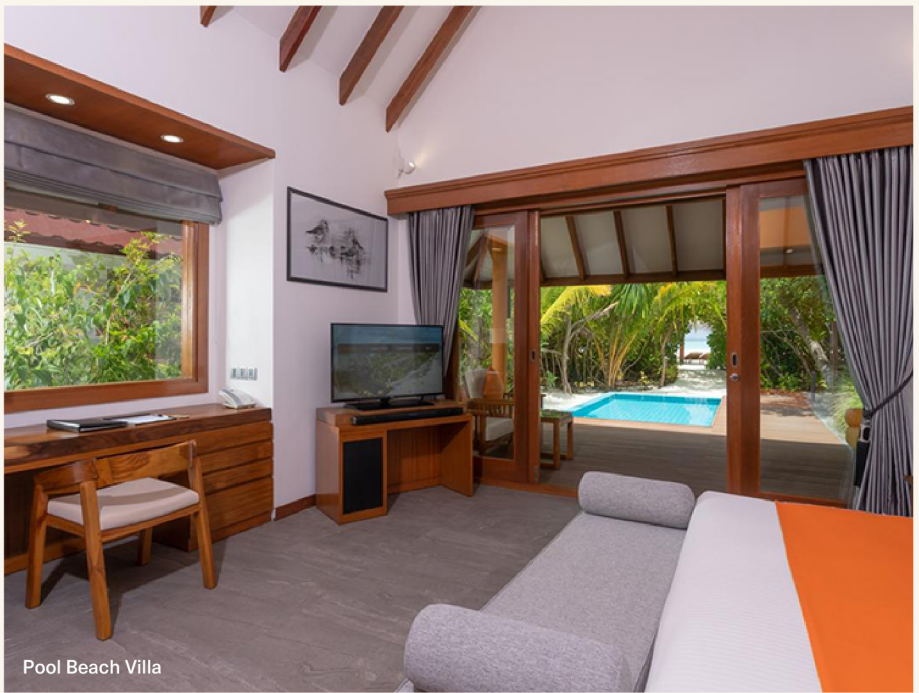
Pool Beach Villa